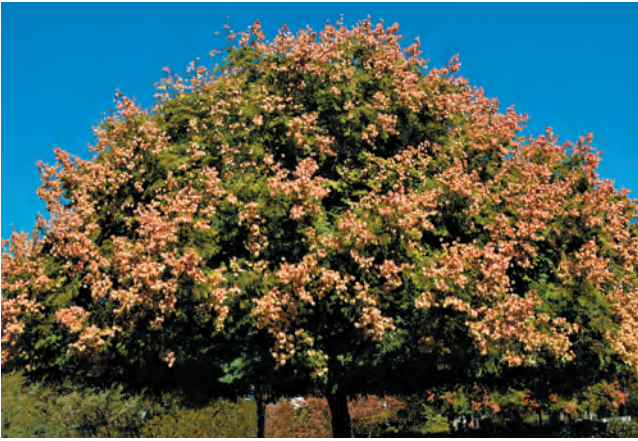
2021 Tree of the Year SBB Website: Chinese Lantern Tree