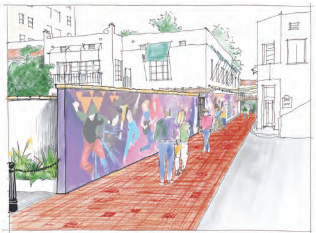
Plaza Granada Mural Rendering