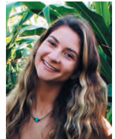
SBB sponsored 2021/22 Scholarship Recipient for Architectural Foundation SB