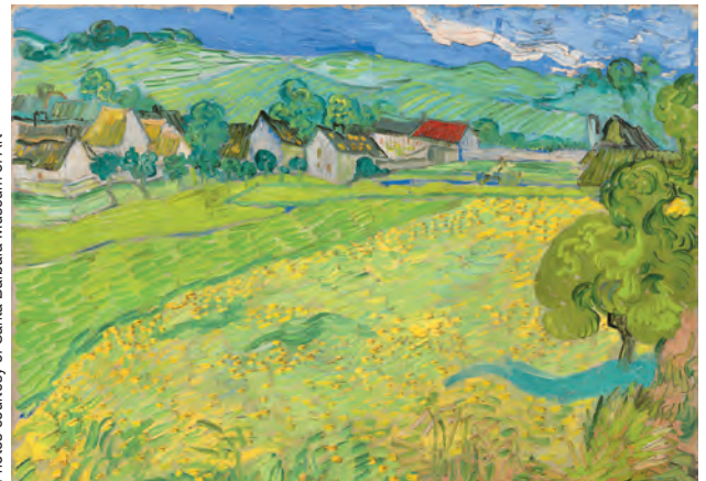
Vincent van Gogh (Dutch, 1853–1890), Les Vessens in Auvers (detail), 1890.