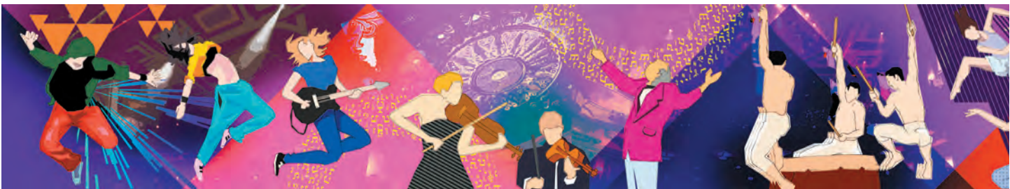
Plaza Granada Mural