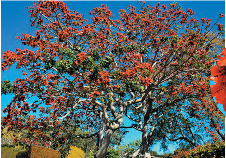
2021 Tree of the Year Edhat.com: African Coral Tree