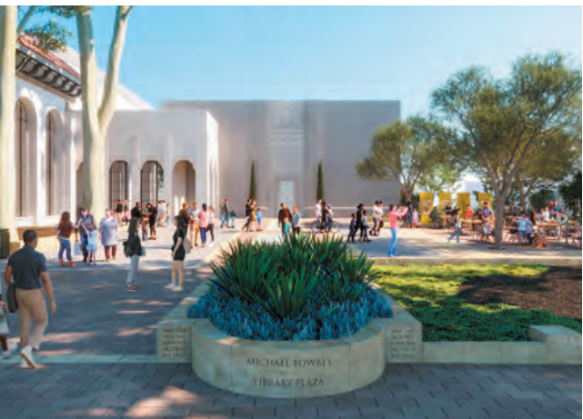
Rendering of SBPL Plaza New Main Monument